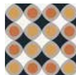
20x20 8"x8" Fun Joy 02 CSAFUJY220