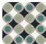
20x20 8"x8" Fun Joy 01 CSAFUJY120