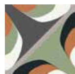
20x20 8"x8" Fun Play 02 CSAFUPY220