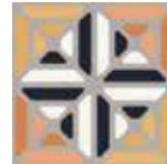
20x20 8"x8" Fun Summer 02 CSAFUSR220