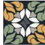
20x20 8"x8" Fun Autumn 02 CSAFUSG220