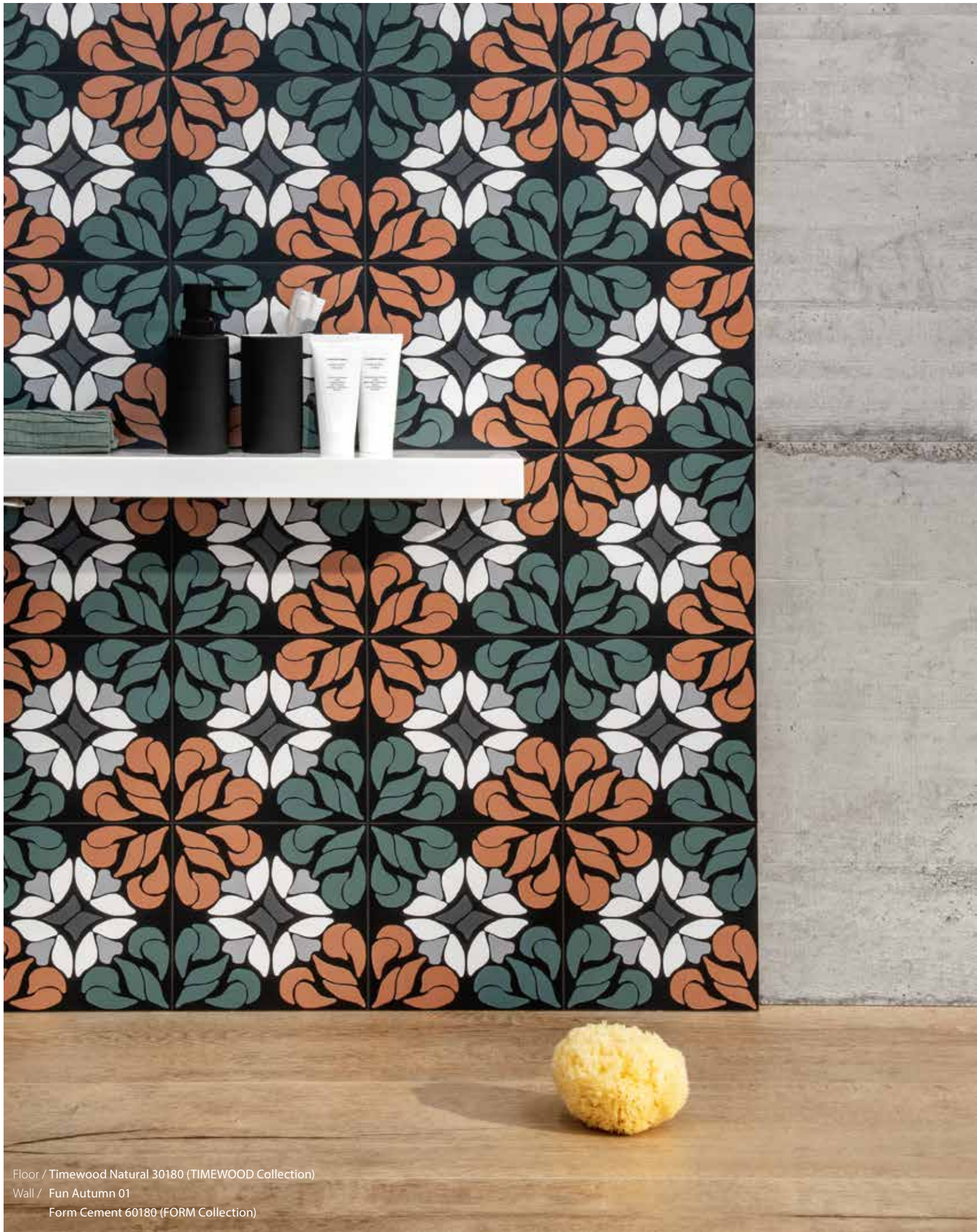
Floor / Timewood Natural 30180 (TIMEWOOD Collection)