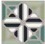
20x20 8"x8" Fun Summer 01 CSAFUSR120