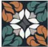
20x20 8"x8" Fun Autumn 01 CSAFUSG120