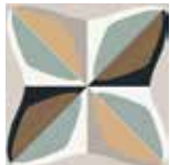
20x20 8"x8" Fun Winter 01 CSAFUWR120