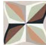
20x20 8"x8" Fun Winter 02 CSAFUWR220