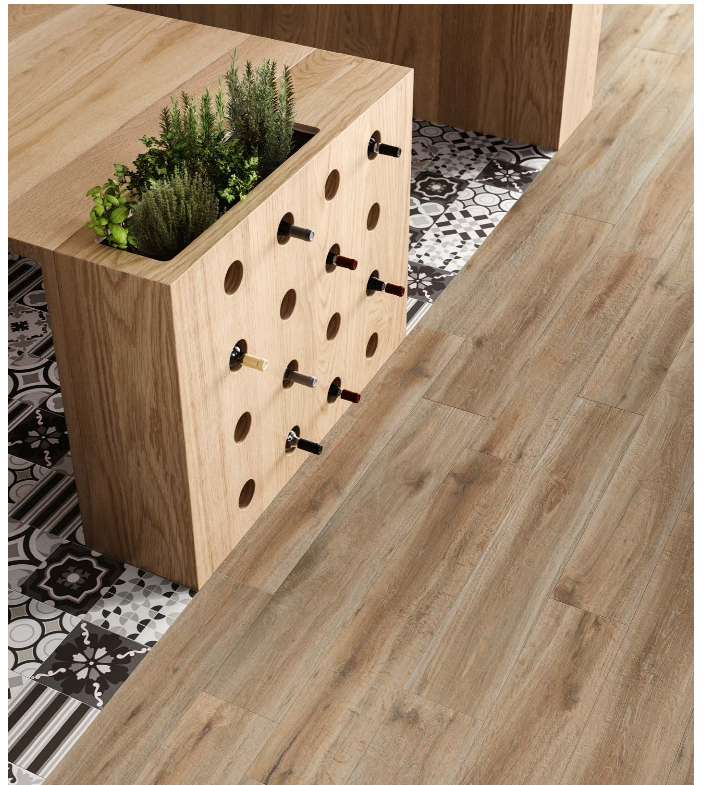
Barkwood Natural 20120