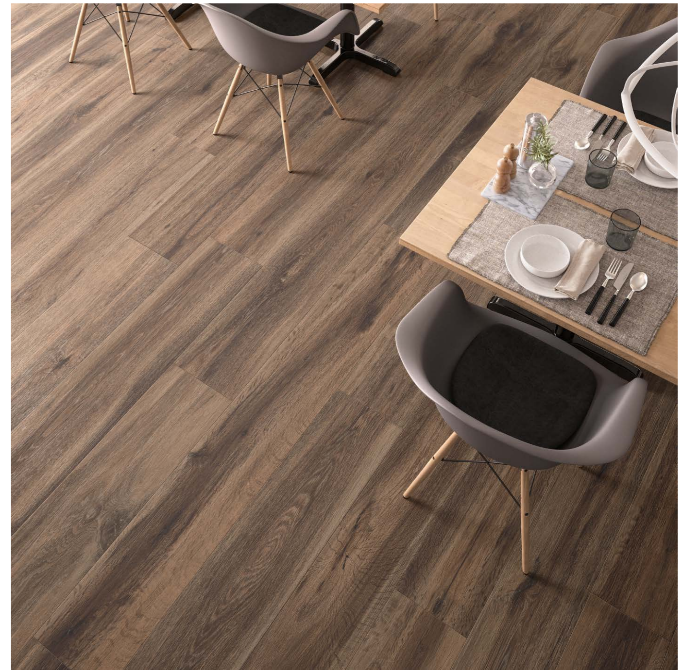
Barkwood Burnt 30180