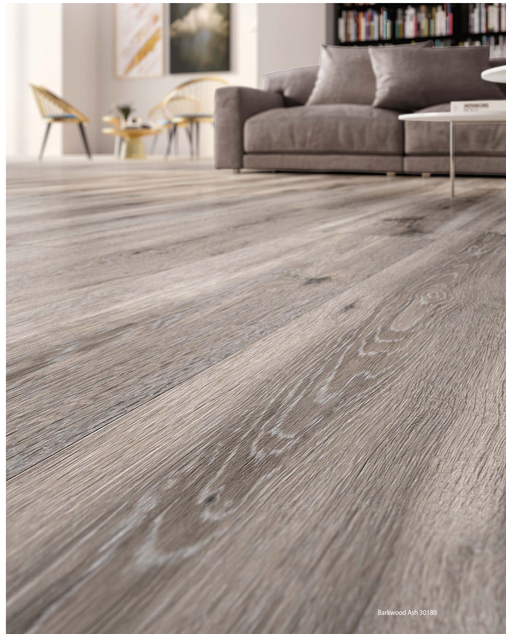
Barkwood Ash 30180

The large 30x180 size can make the most of material beauty and of the graphic and chromatic richness of BARKWOOD slabs. And this "great beauty", associated with the high technical performance of 1 cm - 2/5" thick porcelain, can satisfy the most demanding and qualified design and architecture, in particular for interior use, for large spaces in both the commercial and residential areas, public or private.