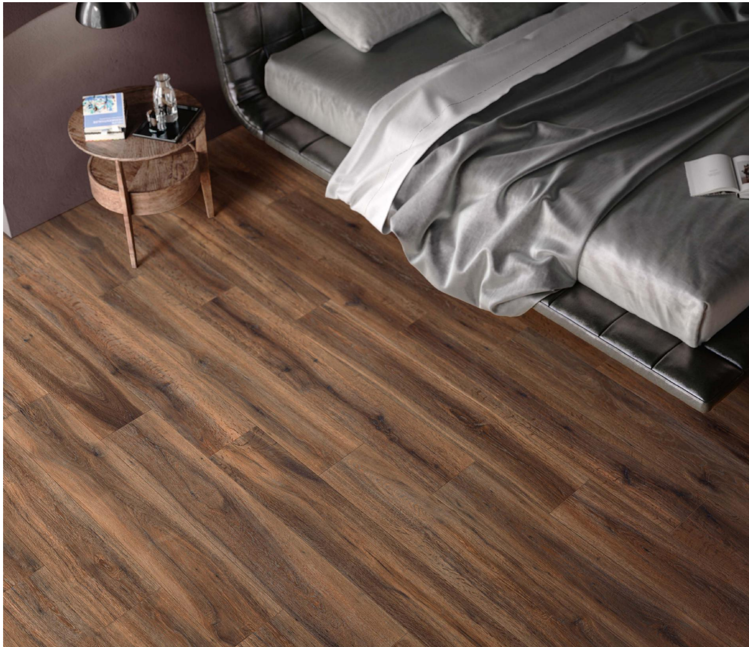
Barkwood Cherry 20120