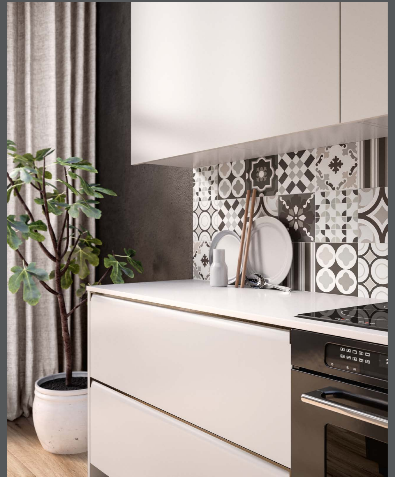
Barkwood Honey 30120