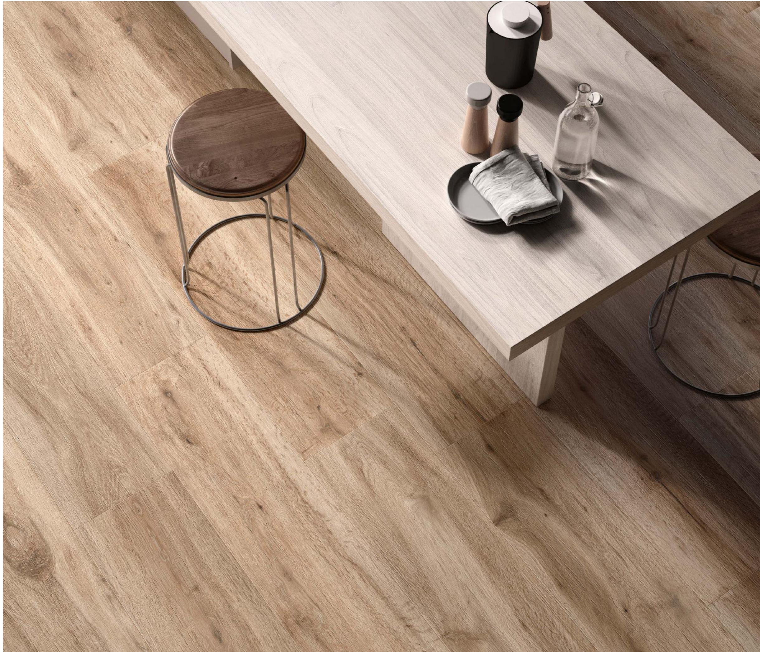
Barkwood Honey 30120