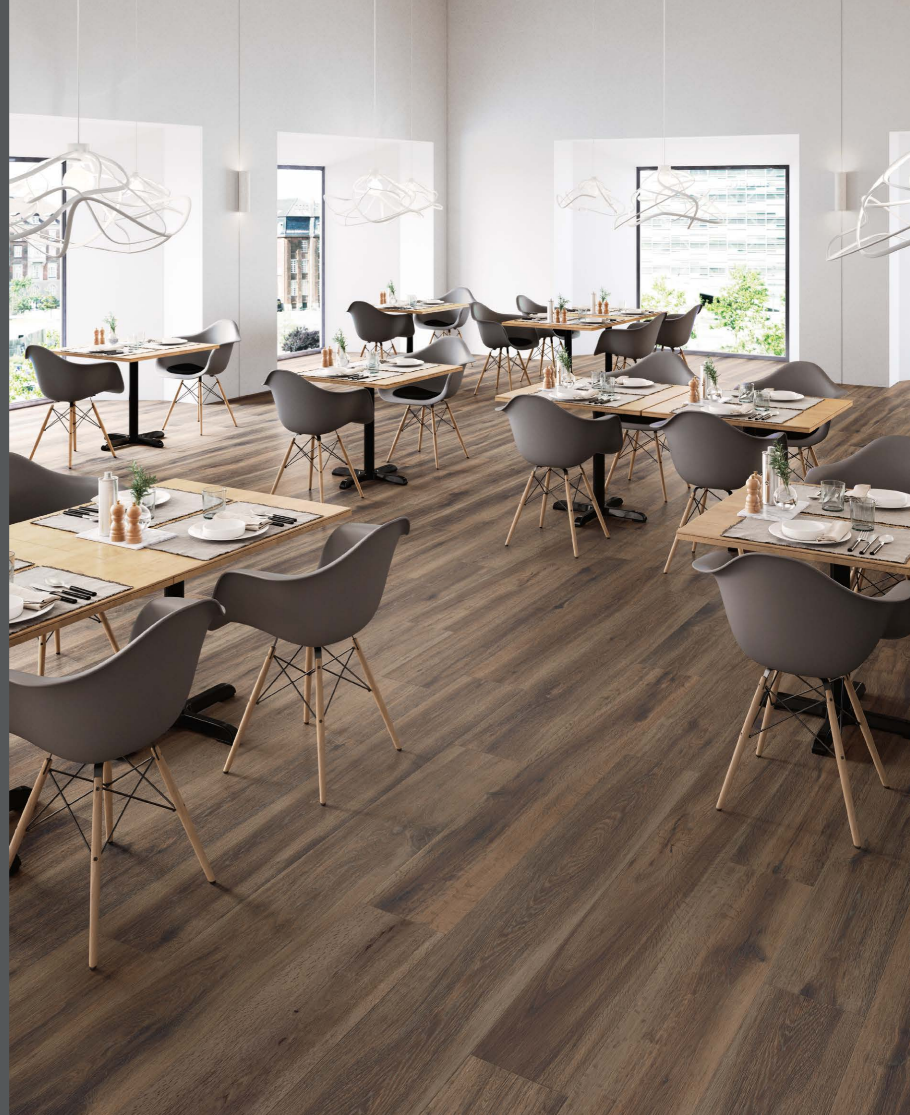
Barkwood Burnt 30180